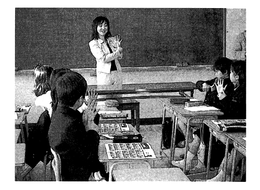
Fig. 3. Photograph of the oral lecture by the first author

We gave Group 1 pupils PYA practice first, followed by an oral lecture. Group 2 pupils were given an oral lecture first, then PYA practice. We gave each group the same problems, but in a different order.