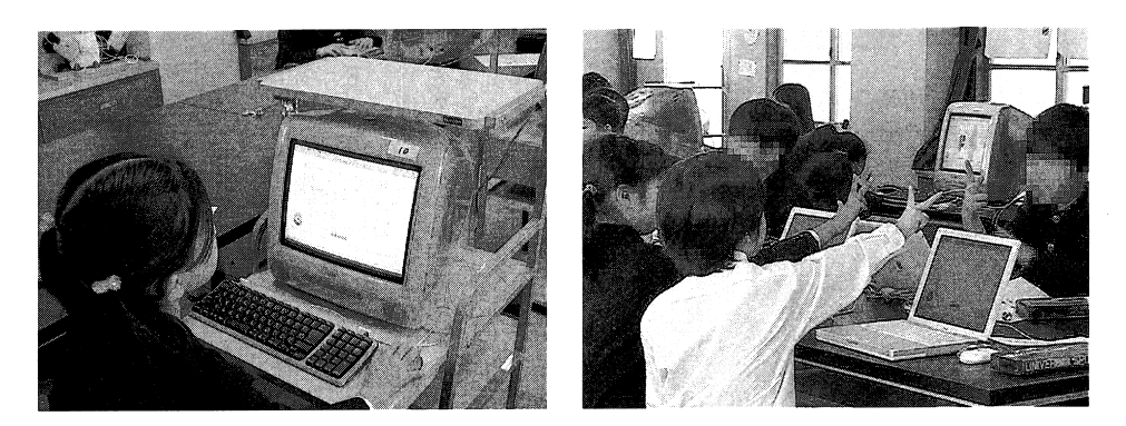
(a) Individual Learning(b) Emergent CollaborationFig. 4. Photographs of PYA Practice

After the practice and the lecture, we conducted individual performance testing to determine how well students understood the language system.